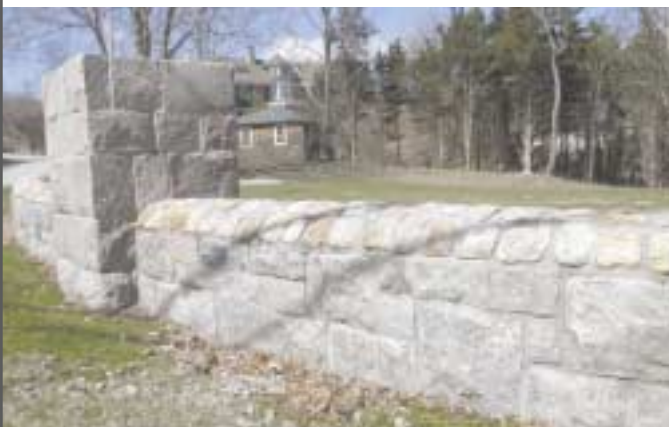
This picture shows the use of Westerly Pink in a recent restoration of an historic wall in Watch Hill. Westerly Pink was integrated with existing stones on the site to restore the wall to its original splendor.