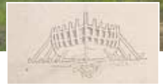
Historical marker on Margin Street commemorating the 19th century shipyard.