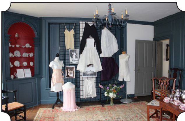
Victorian undies festoon the parlor.