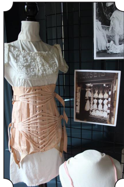
Stays promote good posture.