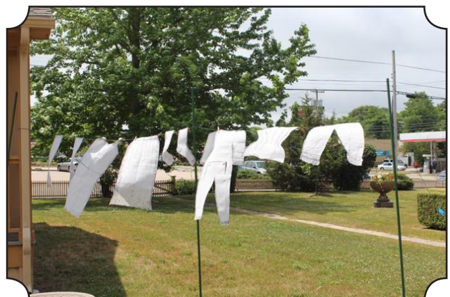
Faux underwear on clothesline attracts visitors.